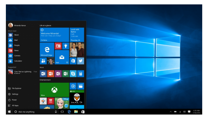
The OS is available as a free update to Windows 7 and 8 users in 190 countries. In addition a new Windows Store is open, and developers get a companion Windows Software Development Kit.

Microsoft says it is the start of a new era-- one where customers put Windows 8 firmly behind-as Windows 10 reaches official launch, with celebrations taking place in 13 different countries.